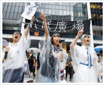
Fig. 2.1 'Scholarism' is an organisation formed by a group of students from the 'post-90s generation'.