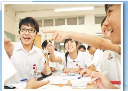
Fig. 2.1 A group of students were discussing in the lesson.