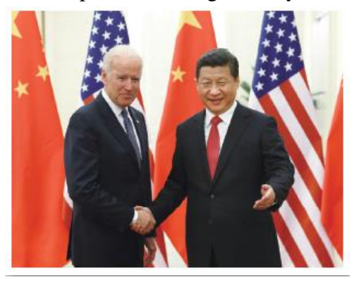
P. 7 Chapter 1 Learning Activity 1 Source 2: