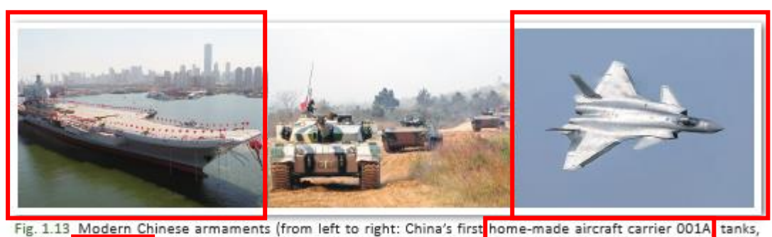
Fig. 1.13 Modern Chinese armaments (from left to right: China's first home-made aircraft carrier 001A tanks, J-20 fighter